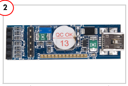
Remove the CY3240 USB-12C Bridge from the package.