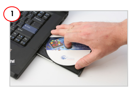
Insert CY3240 USB-12C Bridge Kit CD. Install kit contents, PSoC Designer, PSoC Programmer, and Bridge Control Panel.