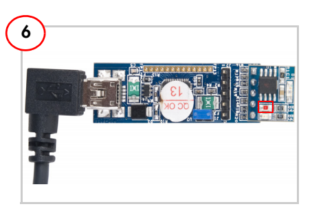
LED D1 of CY3240 USB-12C Bridge and LEDs D3 and D2 of demo board light up.