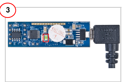
Connect the USB A to Mini B cable and the bridge to the PC. LED D2 (green) lights up.