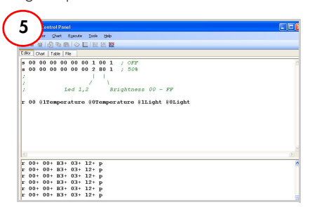
Open the Bridge Control Panel. Click the Toggle Power button to power the board